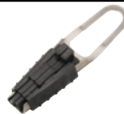
Cable clamp Art. no. 20636